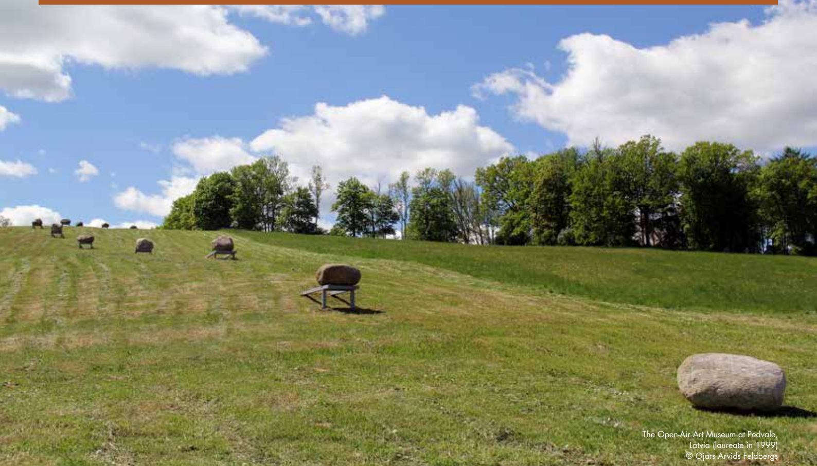
The Open-Air Art Museum at Pedvale, Latvia (laureate in 1999) © Ojars Arvids Feldbergs